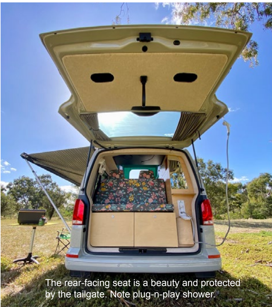
The rear-facing seat is a beauty and protected by the tailgate. Note plug-n-play shower.