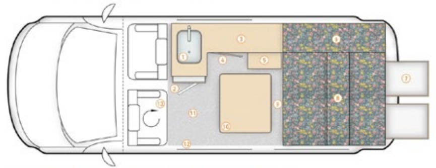
5. LWB VW TRANSPORTER - Long Weekender (Day)