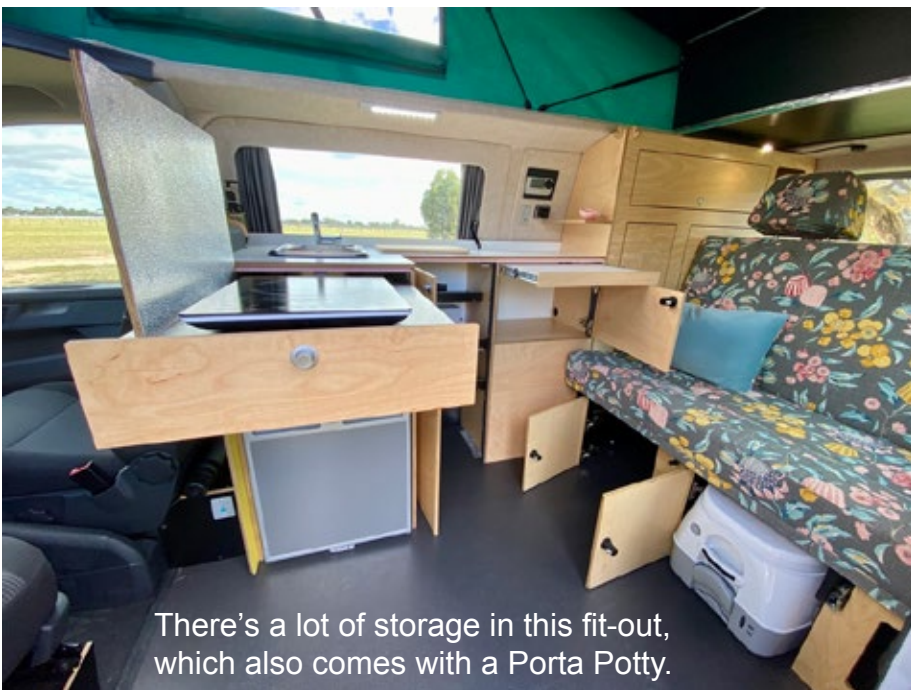
There's a lot of storage in this fit-out, which also comes with a Porta Potty.