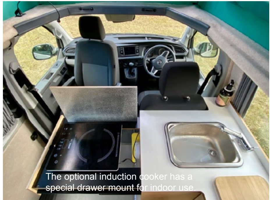
The optional induction cooker has a special drawer mount for indoor use.