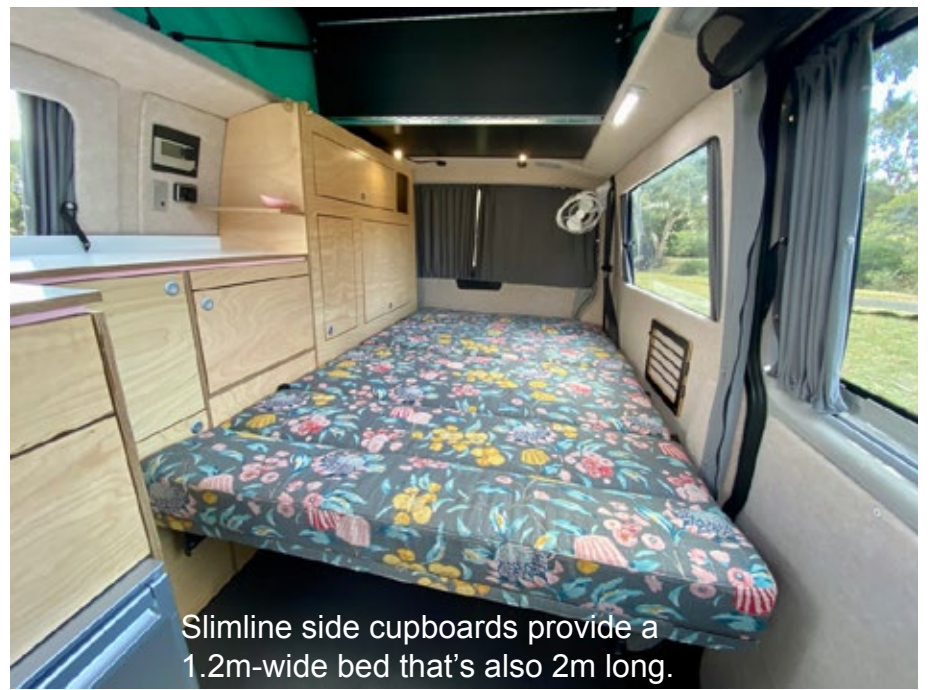
Slimline side cupboards provide a 1.2m-wide bed that's also 2m long.