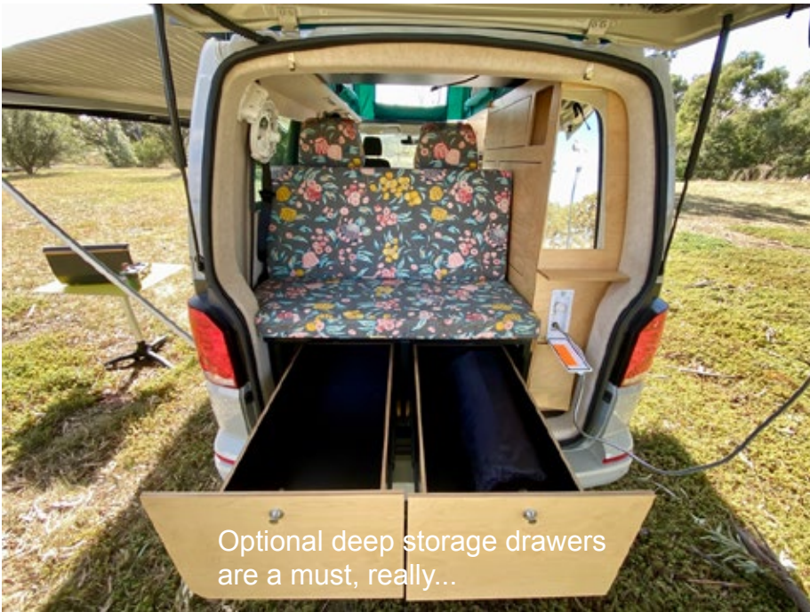
Optional deep storage drawers are a must, really...