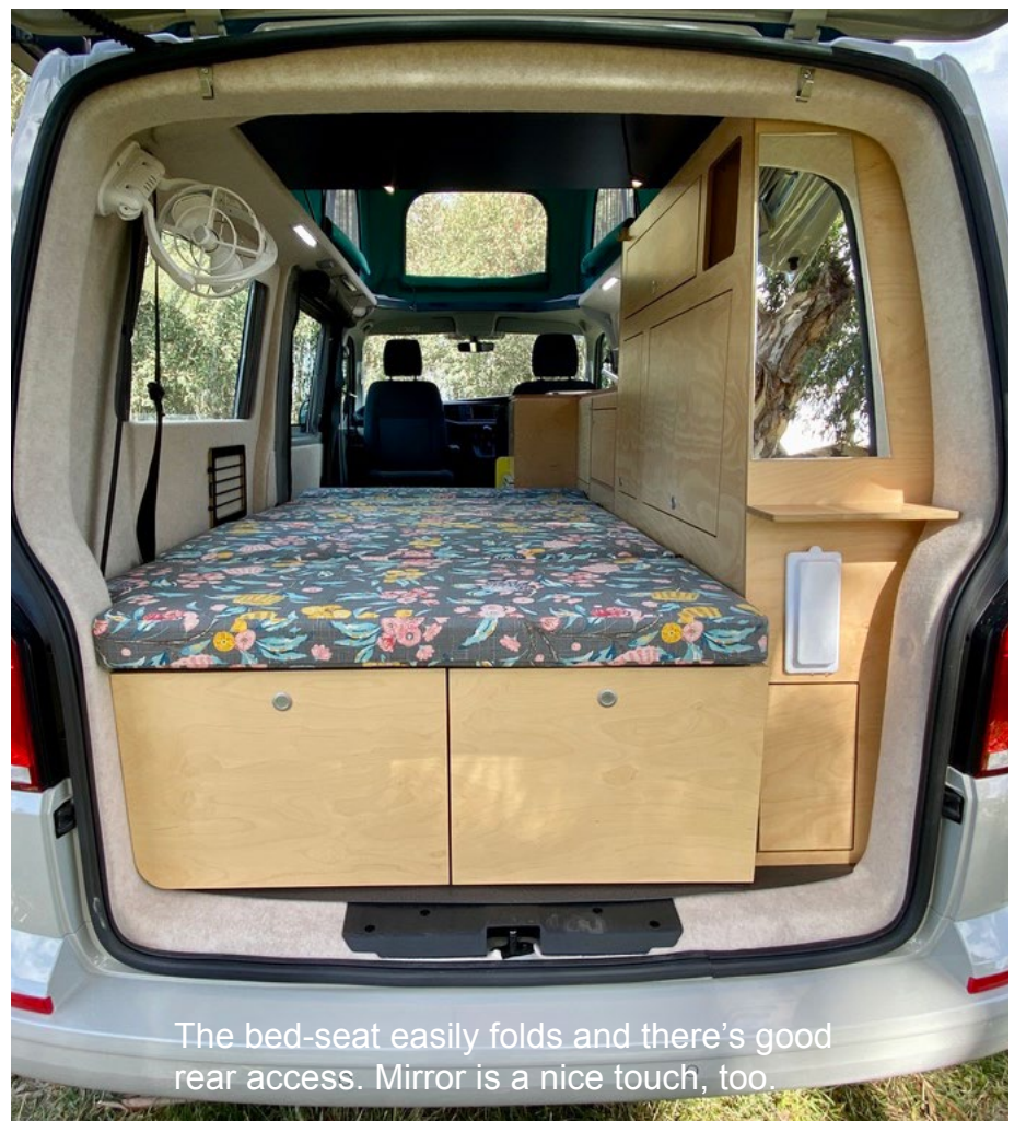
The bed-seat easily folds and there's good rear access. Mirror is a nice touch, too.