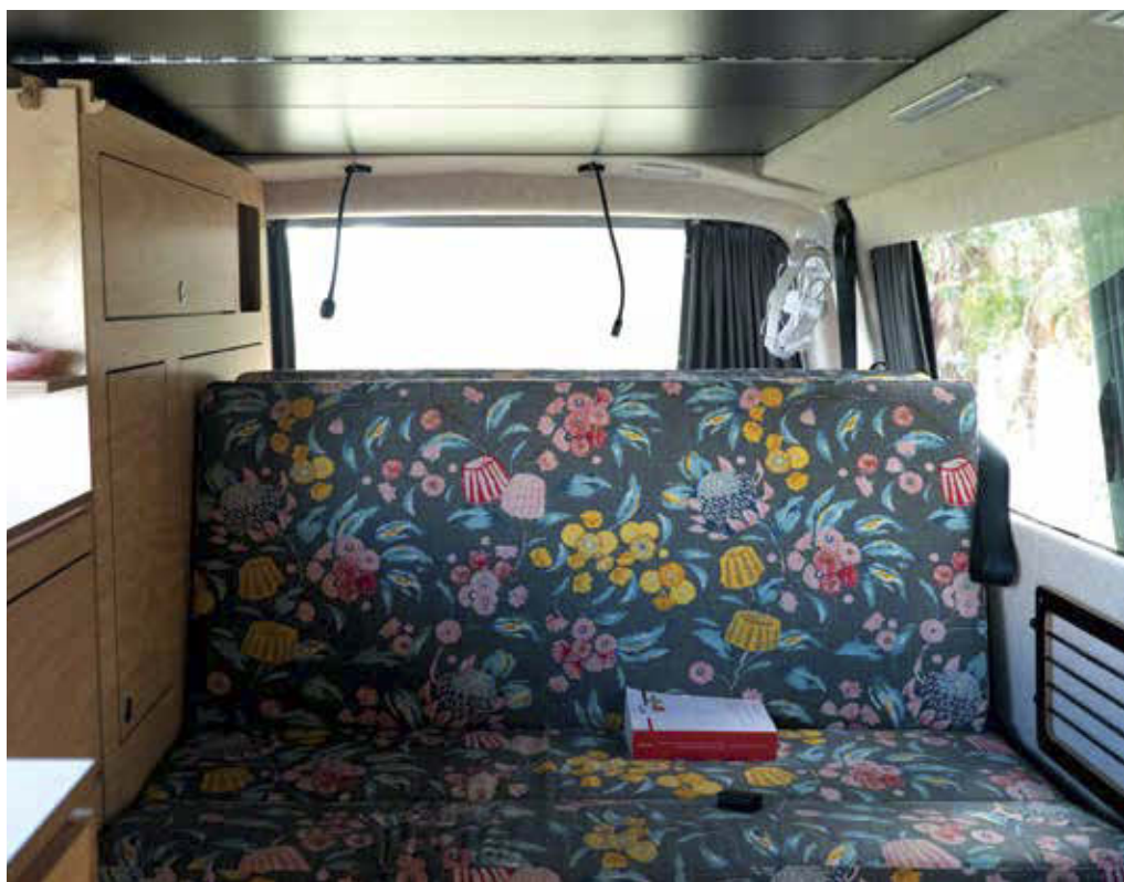
The back seat can legally carry passengers while underway