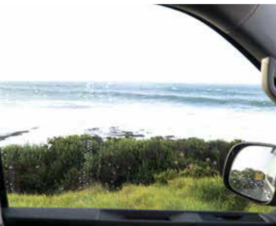
Ideal for coastal driving

Being quite unfamiliar with driving a van on rougher tracks, I did wonder at times whether I had cause for concern, though the Transporter proved me wrong at every turn, showing its considerable amount of power underfoot was more than capable of handling everything thrown its way for the entirety of the four-day trip.