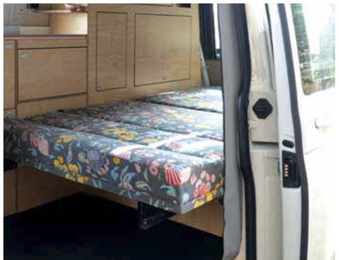
The seat drops easily to form the bed