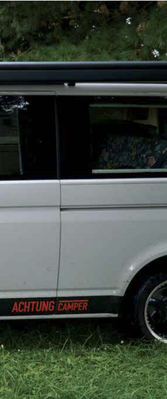
A proven VW Transporter base