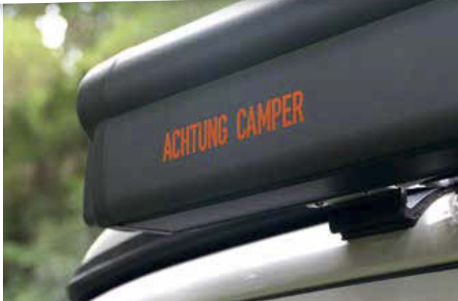
Achtung Camper does a solid conversion