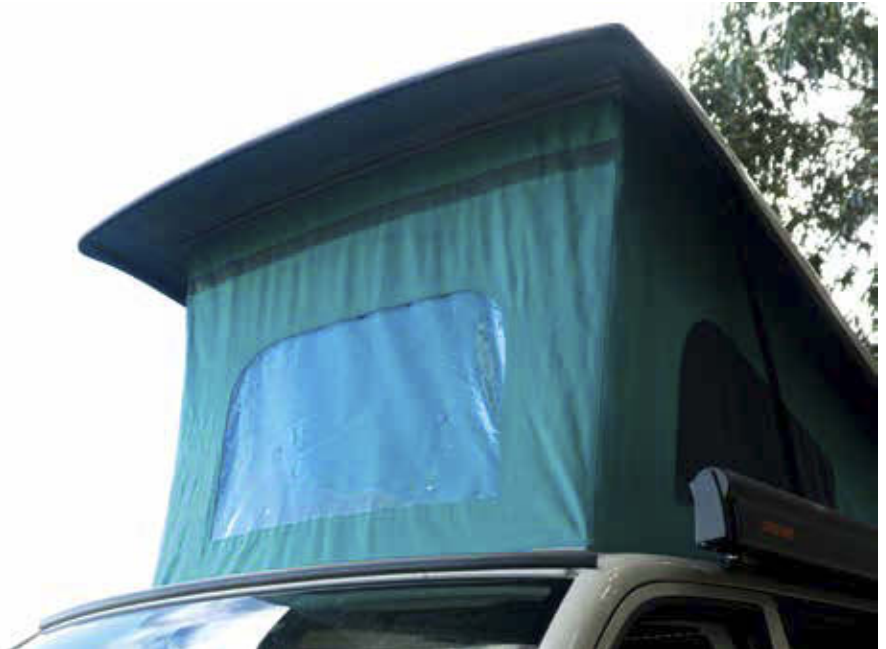
A sturdy pop-top roof offers a sense of space and weather protection

“Despite gales and lashing rain each night, the pop-top felt very solid