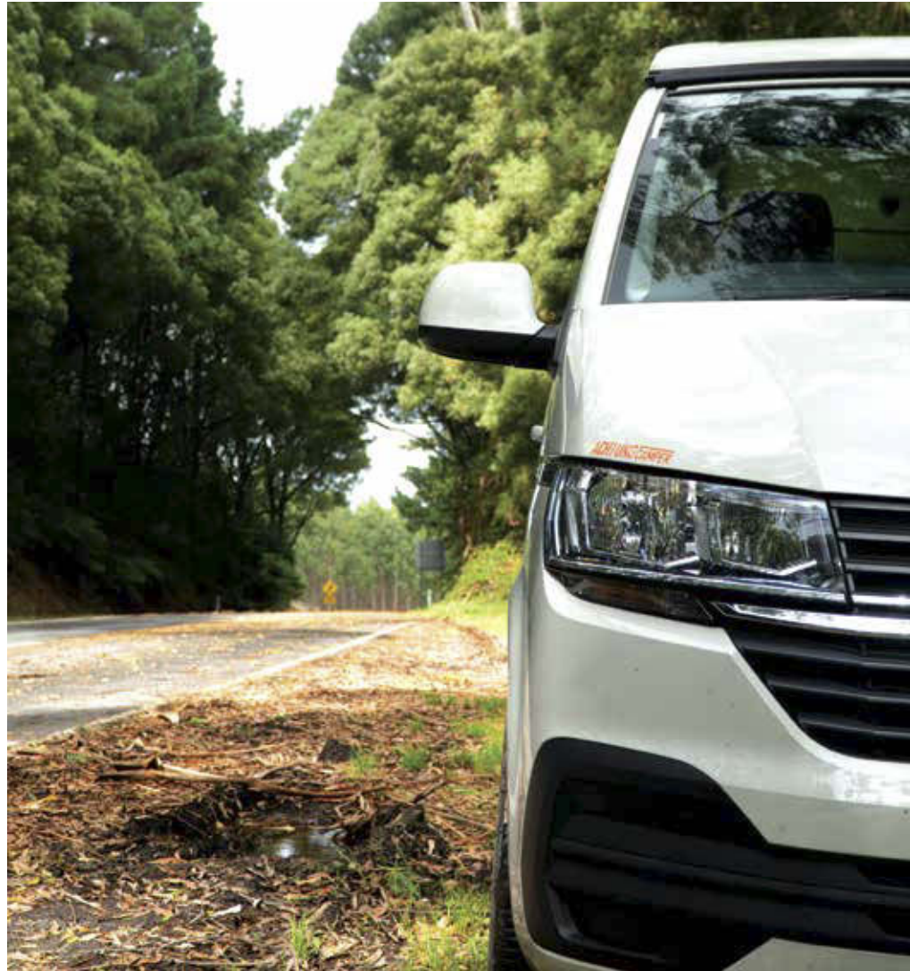
The T6.1 handled all driving conditions