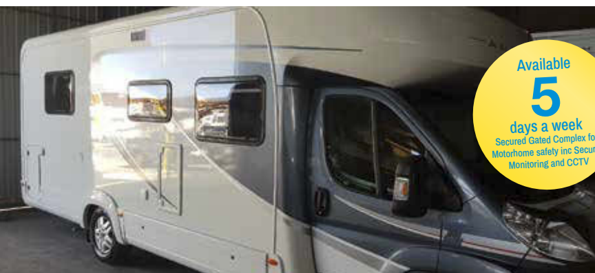
You can customise your windows and paint

The term 'home away from home' is often overused, but it's exactly what Achtung Camper has managed to create. 🚐