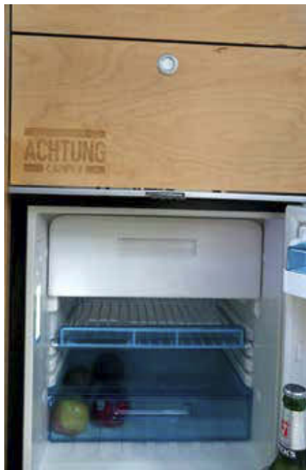
The Waeco fridge/freezer did the job

Achtung Camper 77 Mercer Street Geelong, VIC, 3220 Ph: (03) 5200 9185 W: achtungcamper.com.au