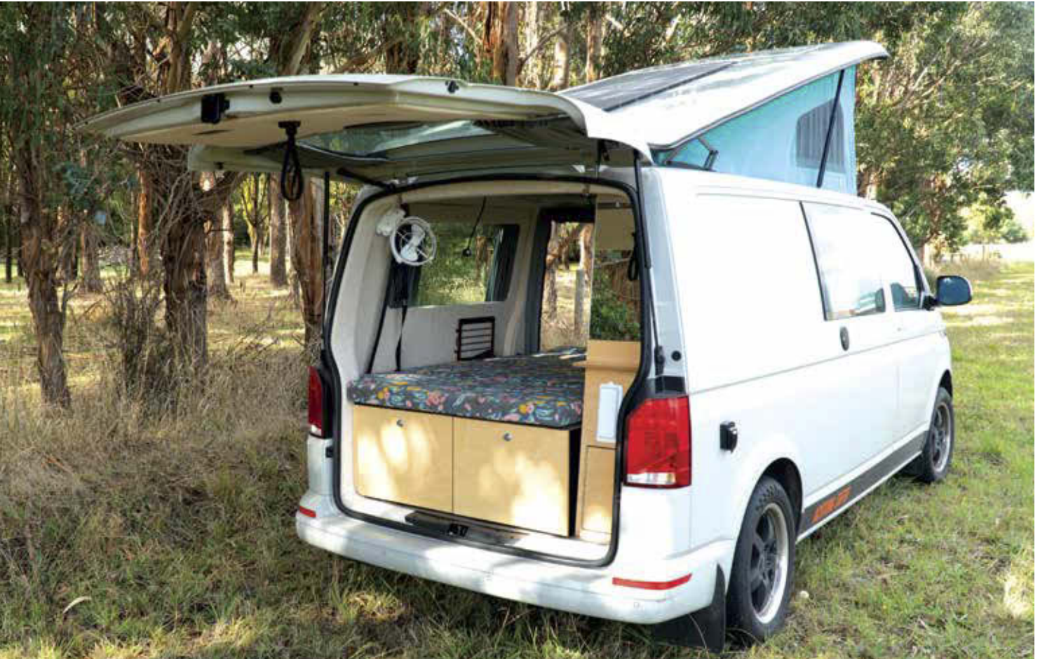
The LWB model offers more room to groove inside, and extra storage