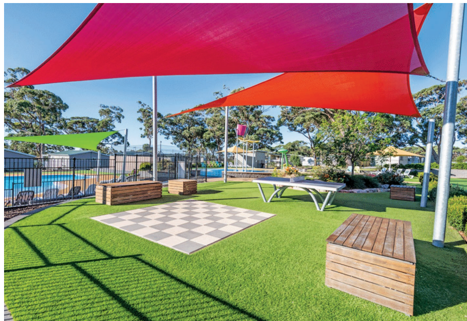
ABOVE TO BELOW Holiday Haven is a wonderland for kids; A splash pad, pool, two playgrounds, a jumping pillow, mini golf, and bowling await